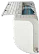
Removable dust filter